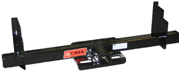
91523 / 91533

(Mounting Plates do not come pre-welded)