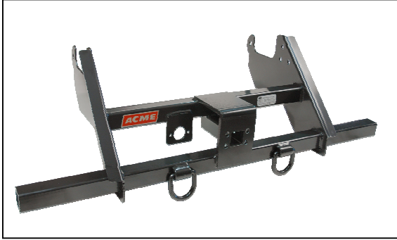
# 91601 Ford ICC Truck Hitch With Tilt Bed # 91603 Chevrolet ICC Truck Hitch With Tilt Bed