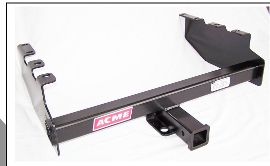
# 91516 • Fits 2001 – 2015 Ford F350 – F550 Cab & Chassis Trucks, 7 1/2" drop; Chevrolet 3500 Cab & Chassis Trucks, 7 1/2" drop