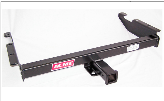
# 91527 • Fits 2011 – 2015 Chevrolet Silverado / GMC Sierra Pickup 2500 HD & 3500 HD Long Bed