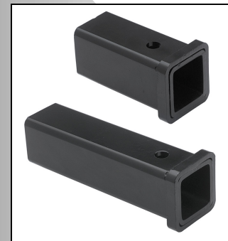
Receiver Tubes - 6" to 72" in length; welded stress collars; raw or black powder coat finish

All ACME hitches, mounts and balls meet and/or exceed all SAE V-5 VESC Regulation specifications.