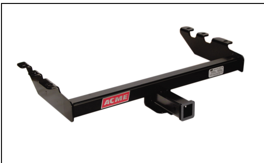
Heavy Duty Custom-Fit Hitches for Pickup Trucks, Vans & SUV's (All mounting hardware and instructions included)